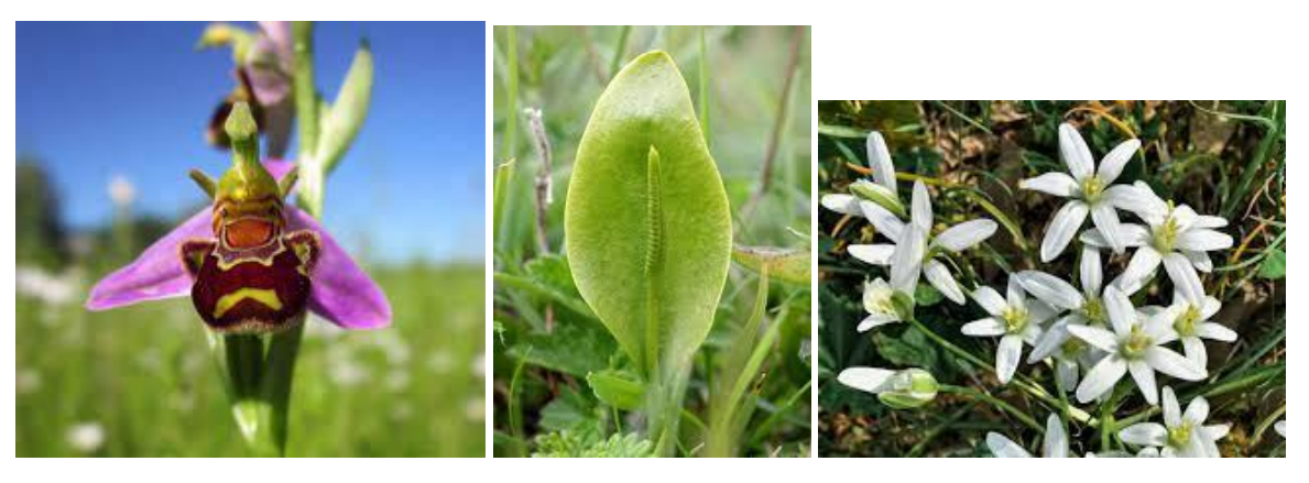
Figure 3 Bee orchid