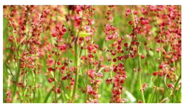
Figure 1 Sheep's sorrel

On 5<sup>th</sup> March 2022 an oak tree was planted on The Cricket in honour of the Queen's Platinum Jubilee.