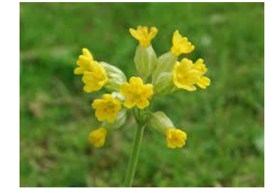
Figure 2 Cowslip

The Parish Council arranges the annual ROSPA inspection for the play equipment and a project is underway to update this particularly to add some equipment for older children.